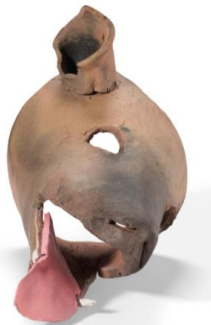
DAISY YOUNGBLOOD (b. 1945) Small Dog's Head painted ceramic 3½ x 6 x 5 in. (8.9 x 15.2 x 12.7 cm.) Executed circa 1987. Estimate: $2,000-3,000 Price Realized: $30,000