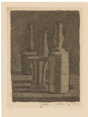
GIORGIO MORANDI (1890-1964) Natura morta con vasetto e tre bottiglie etching, on Japon paper Estimate: $12,000-18,000 Price Realized: $30,000