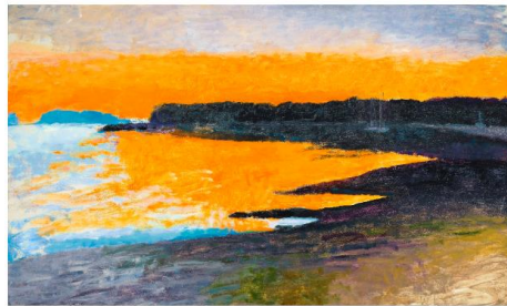
WOLF KAHN (1927-2020) Down East Sunset I oil on canvas 52 x 72 in. (132 x 182.8 cm.) Painted in 1997. Estimate: $50,000-70,000 Price Realized: $206,250